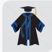
COUNCIL MEMBERS Black gown with blue lining