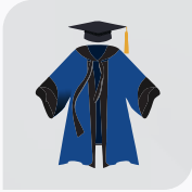
THE PRINCIPAL WEARS Blue gown with black lining