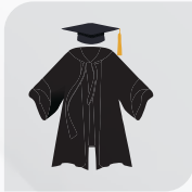
DEPUTY PRINCIPAL WEARS All Black gown